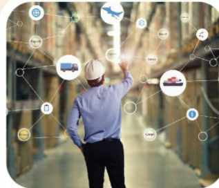
Supply Chain Consulting