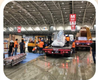
Fairs and Exhibitions